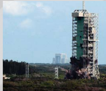
Cape Canaveral AFS