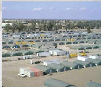
Taji Army Aviation Base