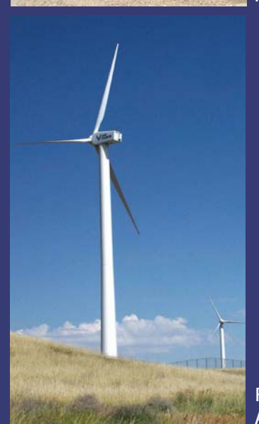
F.E. Warren AFB

We design, deliver and support infrastructure... ... leading the field in project management and services