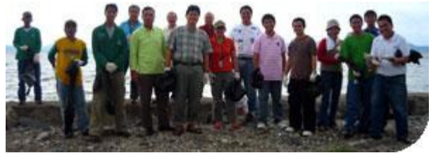
Above: Coastal clean-up team

kilometres away from the Malampaya Onshore Gas Plant.