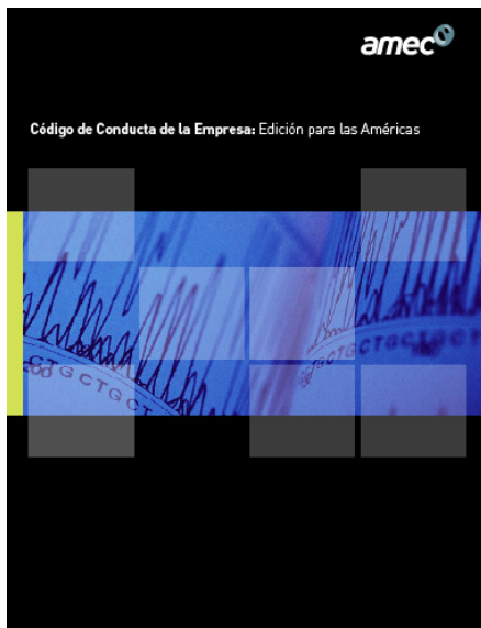
Code of business conduct – Spanish edition

Ethical based risk is considered in all business processes from risk management to human resources. We have set in place a clear mandatory ethical policy, a Code of Business conduct and an ethical helpline (please refer to related documents for further information).